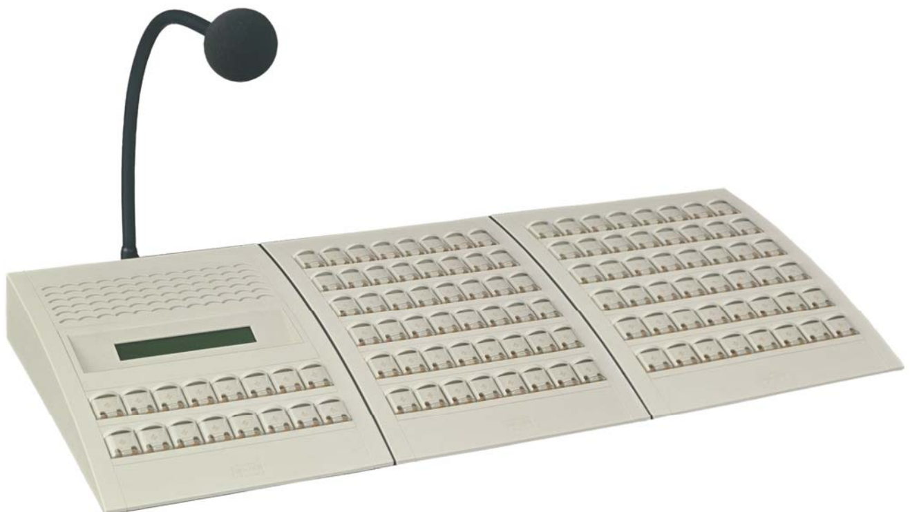
DS-6 Table Call Station with 112 keys